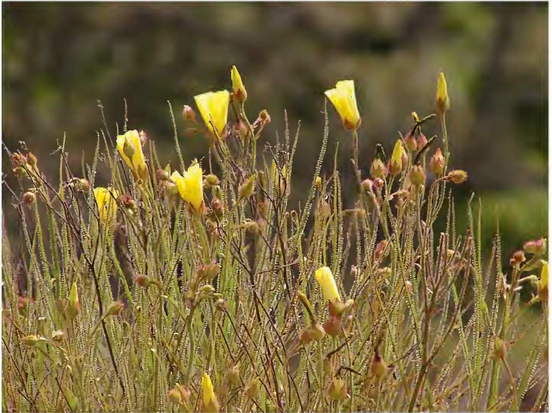
Figure 1: Drosophyllum lusitanicum near Los Barrios, Los Alcornocales Natural Park.